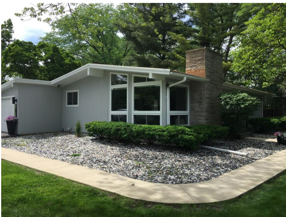
East corner of house.