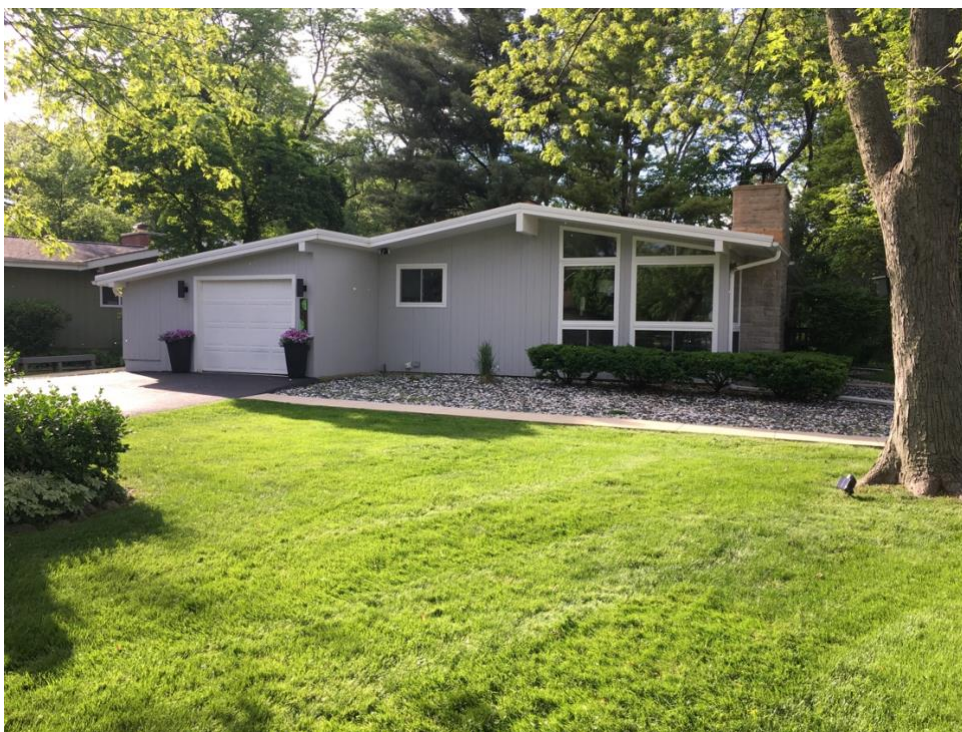
Southeast side of house.