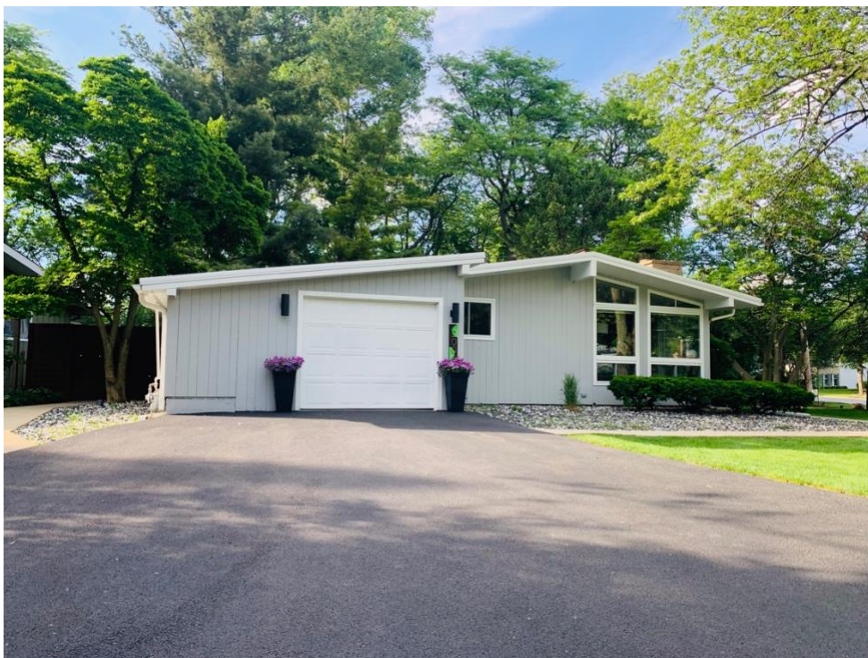
Southeast side of house.