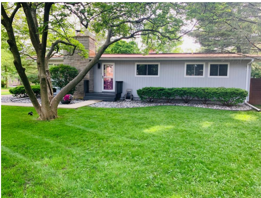
Entrance to house on northeast side.