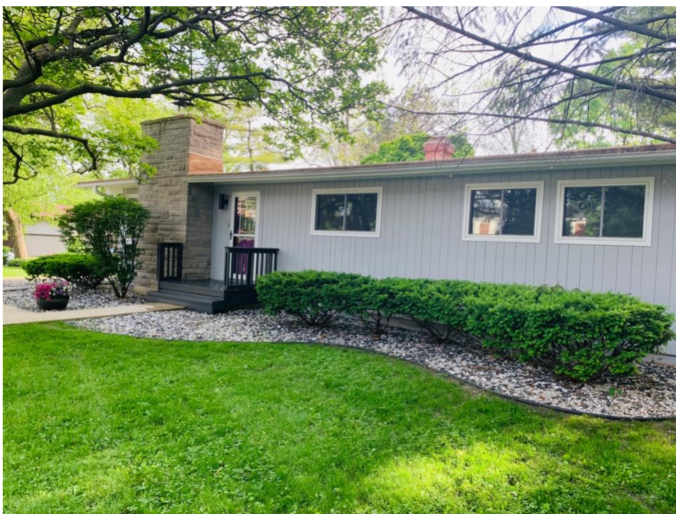
Entrance to house on northeast side.