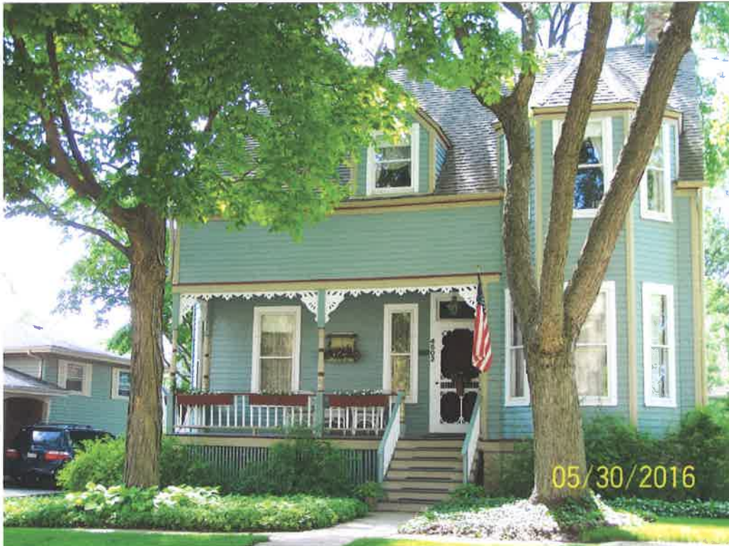
FRONT ELEVATION EAST.