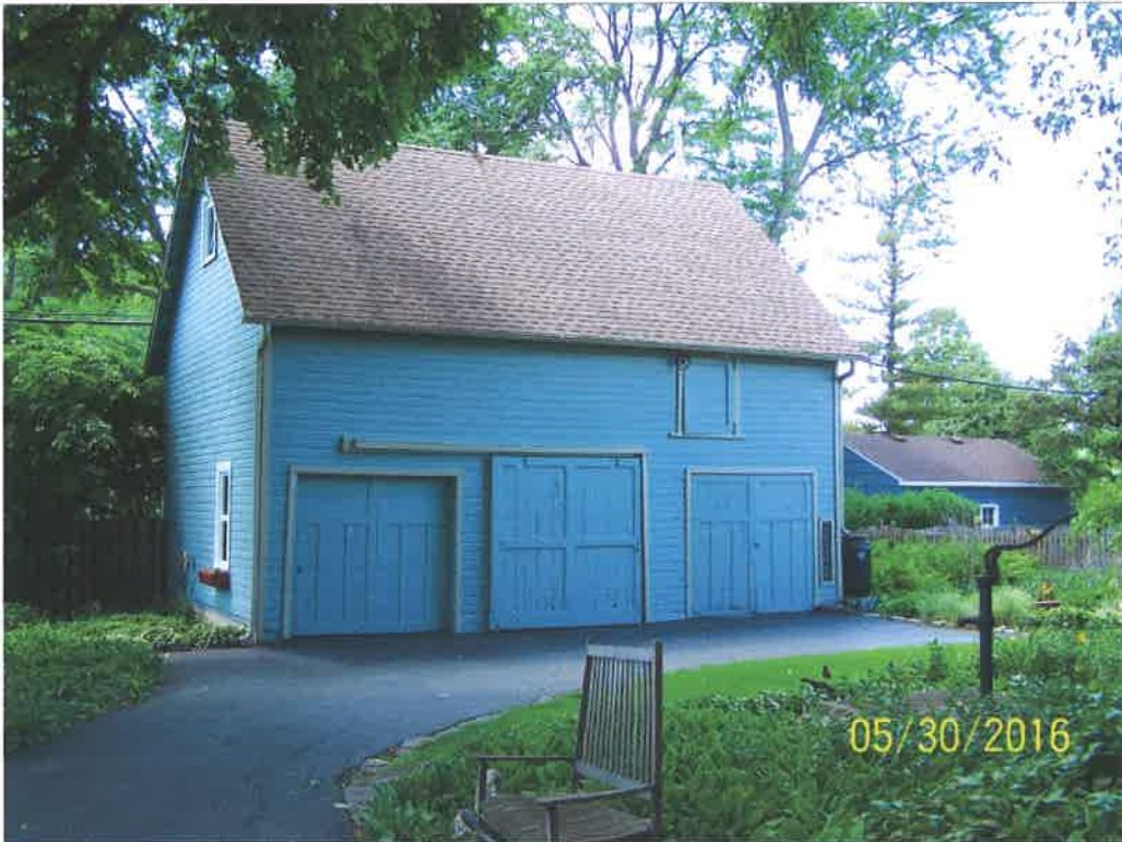
BARN EAST ELEVATION