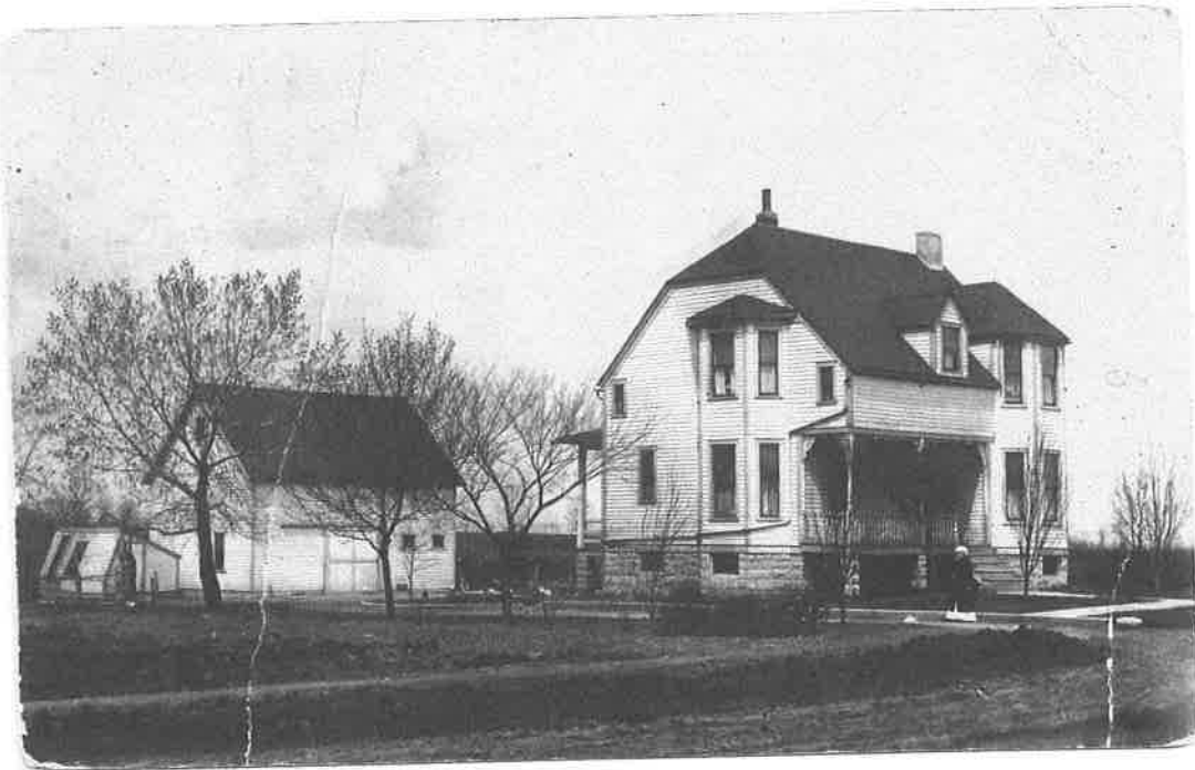
CHRISTMAS POSTCARD 1916