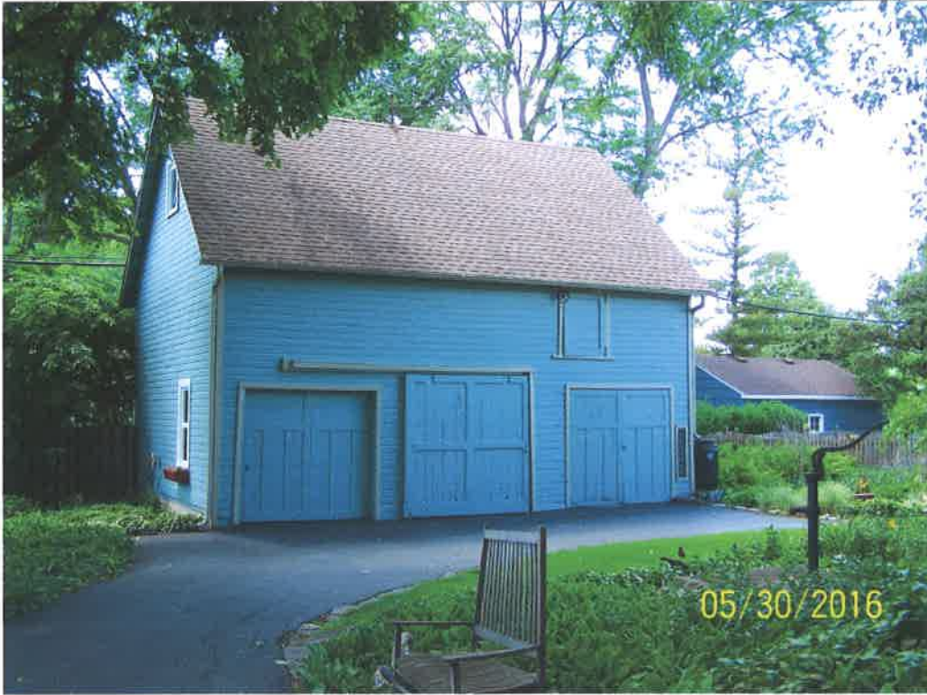
BARN EAST ELEVATION