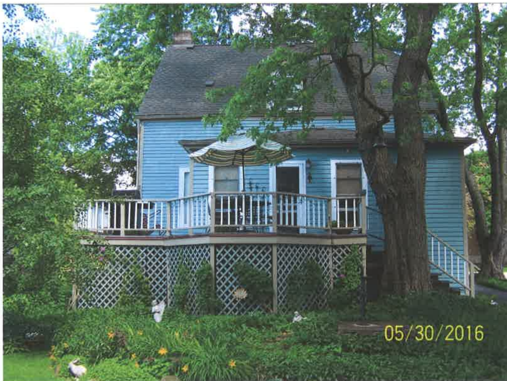
REAR WEST ELEVATION