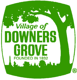
Table of Contents Historic Landmark Application Packet