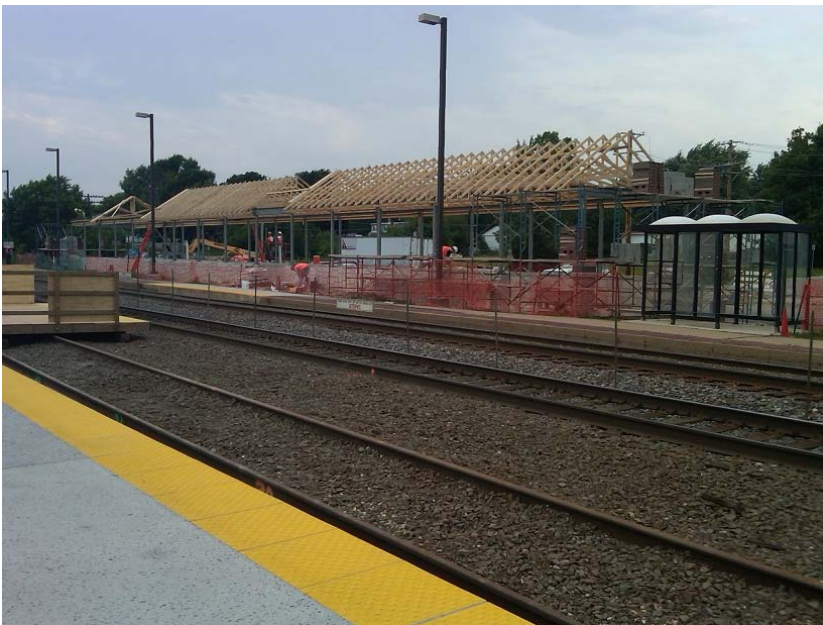
Construction of Pedestrian Tunnel Underway