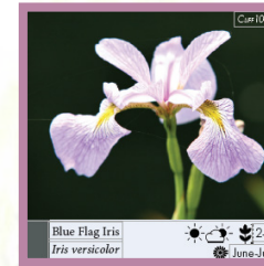
Blue Flag Iris