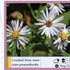
Crooked Stem Aster