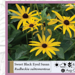
Black Eyed Susan