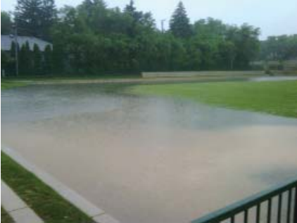
Washington Park Detention Area

The Village has investigated the formation of a stormwater utility since 2003, at which time an exploratory committee was formed. Recently, the Village hired Municipal and Financial Services Group (M&FSG), a firm with expertise in the financial needs of municipalities, to complete a stormwater utility study. The study will review all aspects of a stormwater utility and include specific recommendations for the Village to consider.