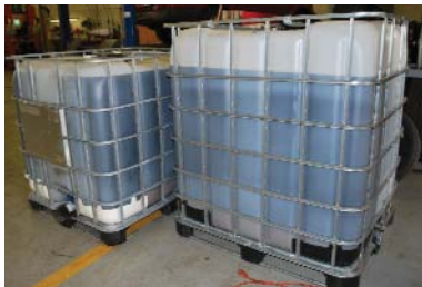
Used Cooking Oil

AFVs save money in the form of lower fuel and maintenance costs. In addition, use of multiple fuels has reduced our reliance on foreign oil and on any single type of fuel. Of the 206 vehicles in the fleet 151 run on alternative fuel including compressed natural gas, E-85, B-20 bio diesel and hybrid electric/fuel power. The implementation of our "green fleet" has decreased fuel consumption by 33,000 gallons since 2007, which is equivalent to a savings of $85,000.