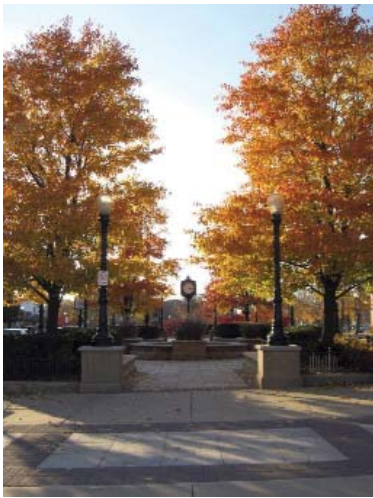
First Place Kate Skegg

Photo buffs were asked to submit original photos capturing the spirit of the Downers Grove community throughout the year and at special events, such as Heritage Festival and the July 4 Parade. Submitted photos will be kept on file and may be used in upcoming publications, promotions or advertising featuring the Village of Downers Grove.