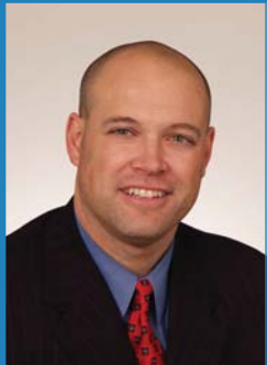
Mayor Ron Sandack

Given the state of the economy and the unprecedented challenges we all must endure during these challenging times, this information is dedicated to providing you with a status report on the steps taken by your Village Council and Village staff to methodically and prudently plan for the continued delivery of necessary Village services.